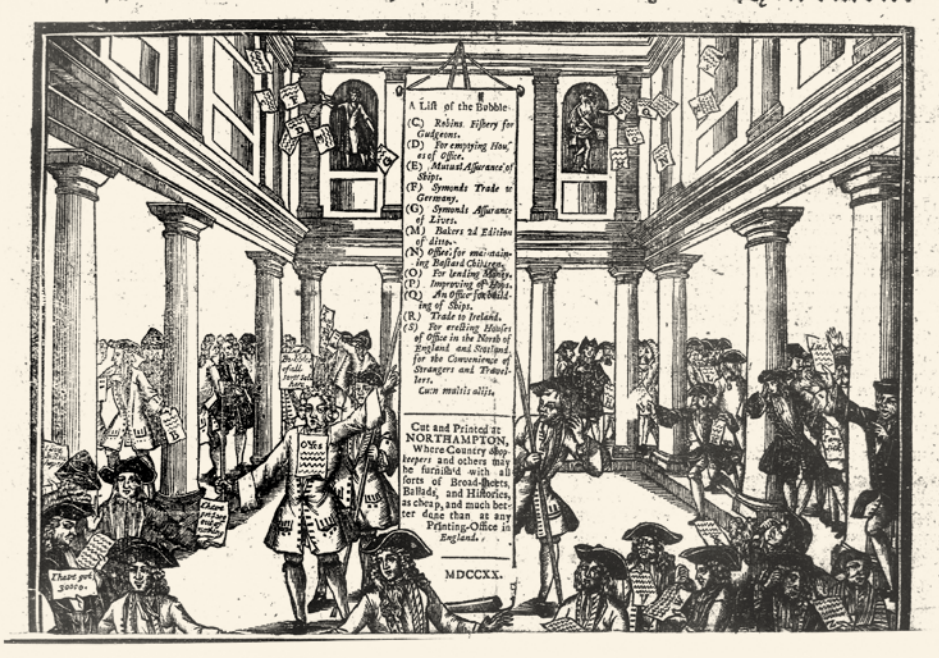
"The Bubblers bubbled, or the Devil take the hindmost." This cartoon was printed in June 1720, at the height of the South Sea Bubble.

£200 billion for the UK, and $2 trillion for the U.S. today). It was "carry on a design of more general advantage to Great- Britain and Ireland, &c. and of more certain profit to the encouragers thereof, than any undertaking yet set on foot: Of which further notice will be given in this paper." Soon the atmosphere became even more frenzied, largely because of the impending passage of the Bubble Act, which outlawed most new companies. For example, on June 8, the Daily Post had an ad for a company "for carrying on a thing that will turn to the advantage of the concerned" with no indications what that "thing" was. But we should note that this was just the newspaper ad, and it is quite possible that when prospective investors showed up in the indicated place for purchasing "permits," they did receive at least some outlines of a business plan. If so, it would be similar to modern venture capital funds, where investors typically are told in advance that it is to concentrate in the biomedical area, say.